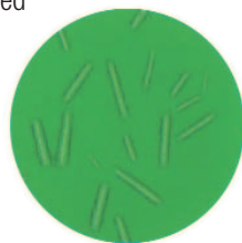
Lactobacillus Bacteria: Image = 80 µm

The presence of active bacteria in the gut can aid the digestive process by helping to break down foods. To attain the health benefits attributed to Lactobacilli fermented foods, live active bacteria need to be consumed on a regular basis. It is believed the life span in the human body of these cells is 3 to 10 days. Only the active forms have the ability to tolerate the acidity of the stomach and the alkalinity of the intestine to produce health benefits.